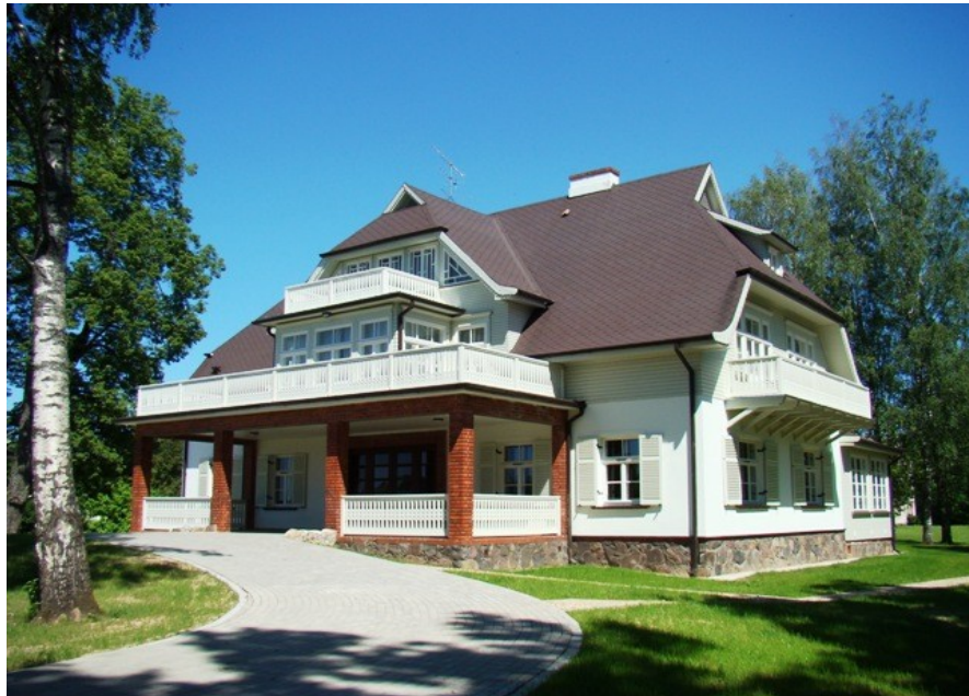
One of the buildings on the RATNIEKI hotel grounds