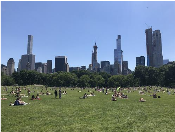
Central Park backdrop